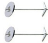
Kable Lite Plaster Anchors