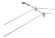
Kable Lite Horizontal Turn