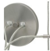
Kable Lite Center Power Feed Single-Feed