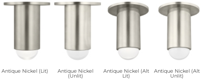
Antique Nickel (Lit) Antique Nickel (Unlit) Antique Nickel (Alt Lit) Antique Nickel (Alt Unlit)

Includes 120V-277V 10.5 watts, 620 delivered lumens, 90 CRI 2700K LED module. Dimmable with most LED compatible ELV, TRIAC and 0-10V dimmers. Ceiling mount only.