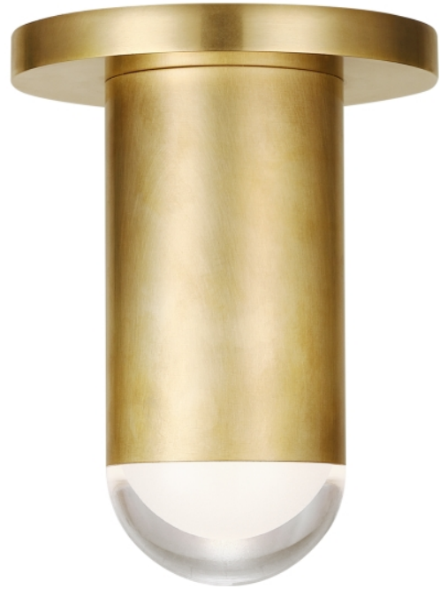
Natural Brass (Lit)