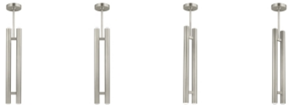
Antique Nickel (Lit) Antique Nickel (Unlit) Antique Nickel (Alt Lit) Antique Nickel (Alt Unlit)

Includes 22.2 watt, 1295 total delivered lumens, 90 CRI 2700K LED modules. Dimmable with most LED compatible ELV and TRIAC dimmers. 277V dimmable with 0-10V dimmers. Ships with 4-12" and 2-6" rigid stems. 120V or 277V. Can be installed on a sloped ceiling up to 30°. Up and downlight.