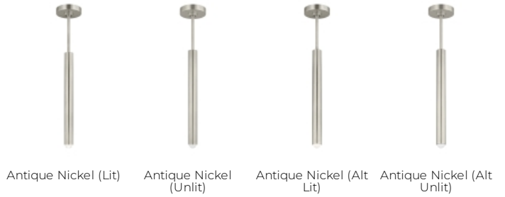
To view all available finish options, please visit techlighting.com

Includes 7.8 watt, 491 total delivered lumens, 90 CRI 2700K LED modules. Dimmable with most LED compatible ELV and TRIAC dimmers. 277V dimmable with 0-10V dimmers. Ships with 4-12" and 2-6" rigid stems. 120V or 277V. Can be installed on a sloped ceiling up to 30°.