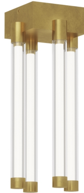
Natural Brass (Lit)