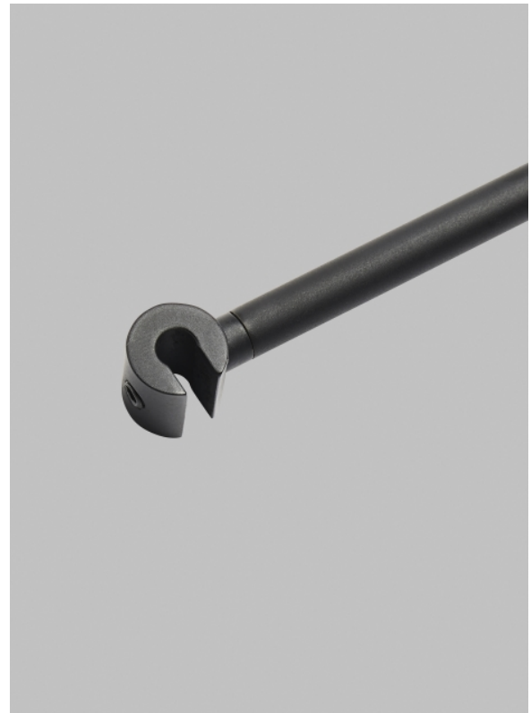
Hook Detail Black