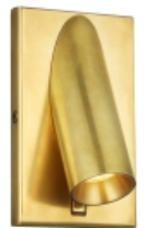
Natural Brass 3/4 view