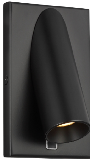
Nightshade Black 3/4 View