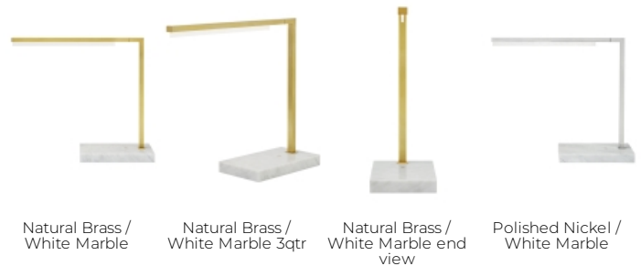
To view all available finish options, please visit techlighting.com