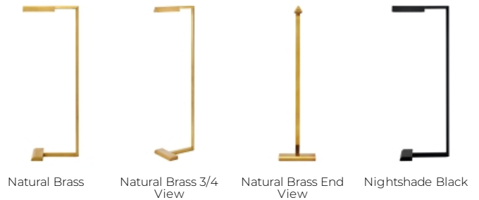
Natural Brass Natural Brass 3/4 View Natural Brass End View Nightshade Black

To view all available finish options, please visit techlighting.com