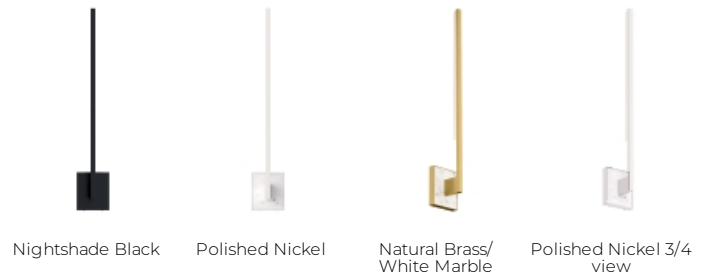
To view all available finish options, please visit techlighting.com