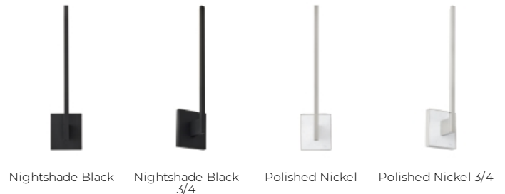
To view all available finish options, please visit techlighting.com

Includes 11.7 watt, 939 delivered lumens, 3000K 90 CRI LED module. 120V dimmable with most LED compatible ELV and TRIAC Dimmers. 277V compatible with 0-10V dimmers. ADA compliant. Mounts up or down. 120V or 277V.