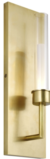
Natural Brass 3/4 view