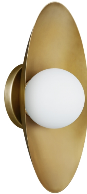
Aged Brass Side View