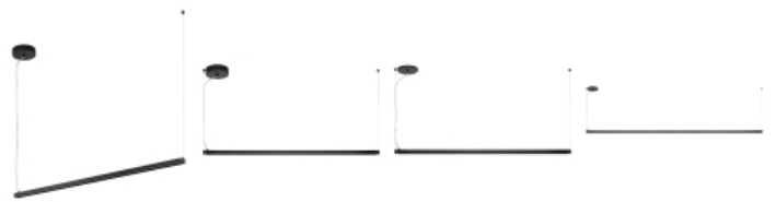
Anodized Black Surface Black 48 Remote Black 48 Remote Black 96

To view all available finish options, please visit techlighting.com