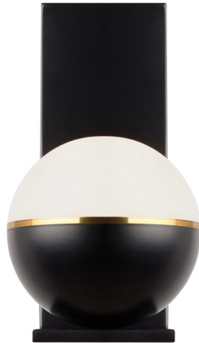
Matte Black / Aged Brass

Includes 14 watt, 556 delivered lumen, 2700K LED module. Dimmable with low-voltage electronic or triac dimmer.