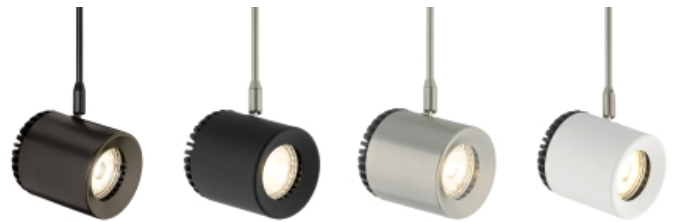
Antique Bronze / Antique Bronze