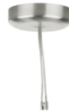
Kable Lite Mini Surface Electronic Transformer