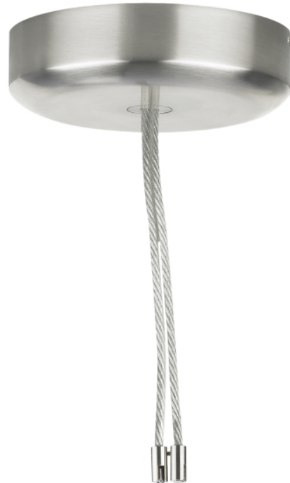
Kable Lite Mini Surface Electronic Transformer

Constructed of die-cast aluminum and can power lamps totaling up to 300 watts. The transformer is concealed inside a decorative housing and features fast acting secondary short circuit and overload protection that will safely turn the system off should a short occur. Once the short has been removed, the unit can be reset by simply flipping the wall switch off and on. Mounts to a standard 4" ceiling junction box with round plaster ring (provided by electrician). Each cable lead is 4 feet in length.