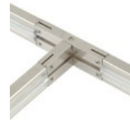
MonoRail T Connector