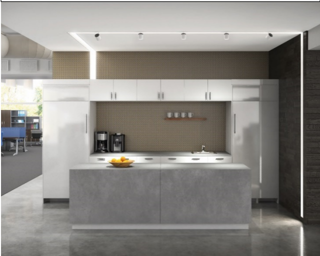
Below: The ELEMENT LED Merge with Tech Lighting's Iso heads.