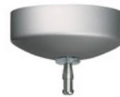
MonoRail Surface Transformer-75W Mag