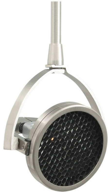
With Eggcrate Louver

Integral louver lens holder can hold a single glass lens (sold separately) or an eggcrate louver (included). Low-voltage, MR16 lamp of up to 50 watts (not included).