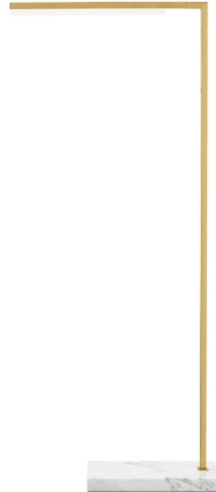
Natural Brass / White Marble

Includes 120-240 volt 10.1 watts, 1075 delivered lumens, 90 CRI 2700K LED module. Built-in three way dimming. Includes 6 feet of black cloth cord.