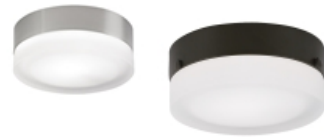
Satin Nickel Small