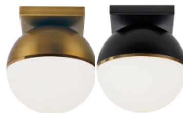
Aged Brass / Bright Brass