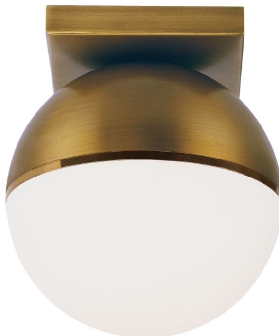
Aged Brass / Bright Brass