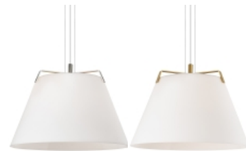
Polished Nickel / White