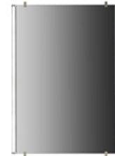
Rae Mirror Kit