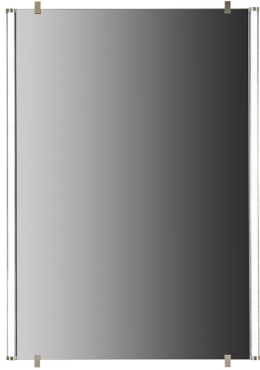
Rae Mirror Kit

The LED channel provides an amazingly slim profile less than 1 inch deep with flawless, even illumination and great color reproduction. Comes complete with 3.9watt/ft of LEDs to create 300lms/ft or 7.8 watt/ft of LEDs to create 600lms/ft available in 4 CCT options and 2 CRI options. Dimmable with low-voltage electronic dimmer.