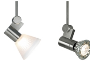
With Cone Accessory