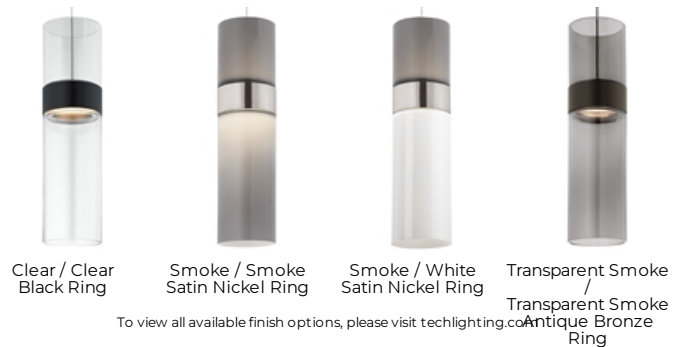
Clear / Clear Black Ring

Includes 6 watt, 377.8 delivered lumens 80 CRI 3000K, LED. Dimmable with most LED compatible ELV or Triac dimmers. Ships with 16 feet of field cuttable suspension cable.