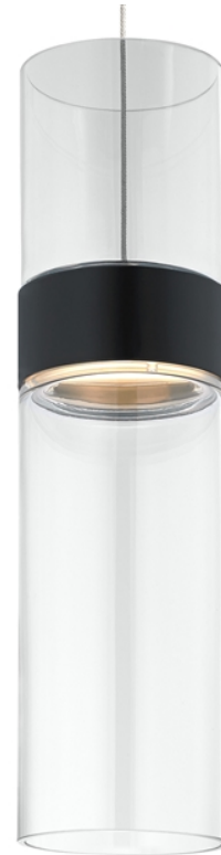
Clear / Clear Black Ring