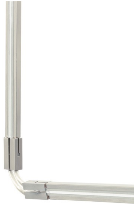
MonoRail Flexible Vertical Connectors