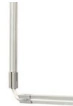
MonoRail Flexible Vertical Connectors