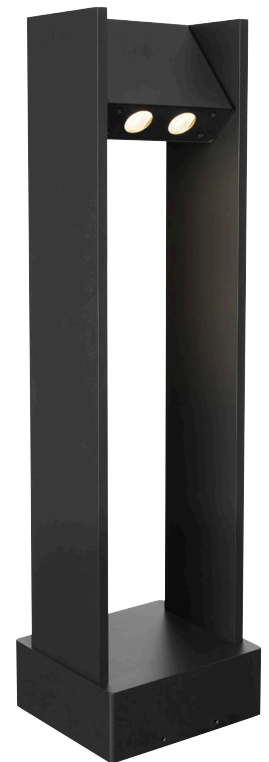
ZUR BOLLARD shown in black