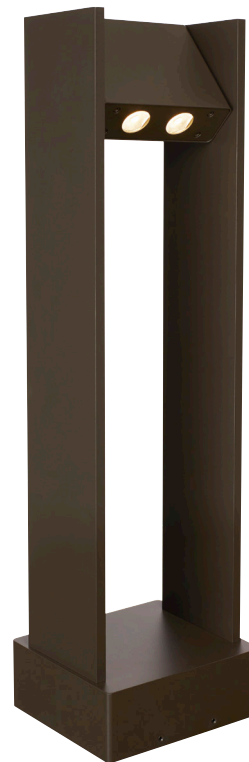
ZUR BOLLARD shown in bronze

**Bollard base not suitable for branch circuit through wiring.