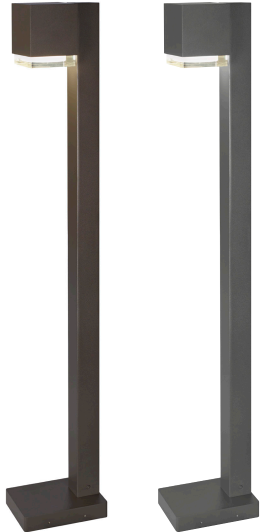
VOTO BOLLARD shown in bronze