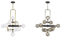
opal / brass smoke / polished nickel