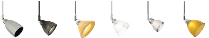
with bell accessory with mesh tinkerbelle shield accessory with onyx cone accessory with prism glass shield accessory with round glass shield accessory with soda glass shield accessory