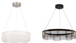
frost / satin nickel 24"