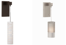
antique bronze shown with reveal (not included) satin nickel shown with manchon (included)