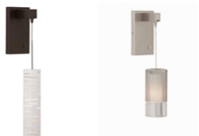
antique bronze shown with reveal with manchon (not included) satin nickel shown included