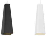
textured black / black textured white / white