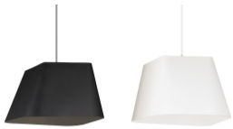
textured black / black textured white / white