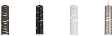
antique bronze gloss black gloss white satin nickel