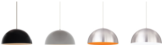
gloss black / white gloss white / white satin nickel / sunrise orange satin nickel / white