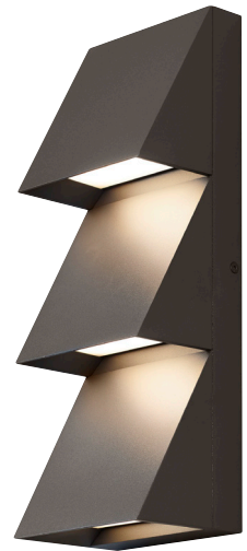
PITCH TRIPLE shown in bronze