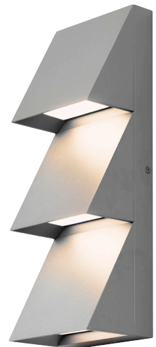
PITCH TRIPLE shown in silver