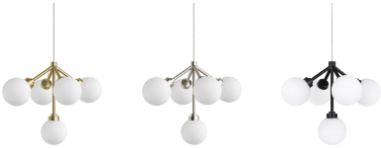
white/aged brass white/satin nickel white/matte black