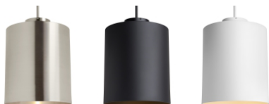
brushed aluminum matte black matte white