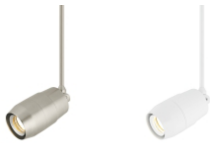
envision led head satin nickel envision led head white