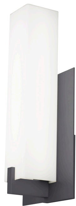
COSMO 18 shown in charcoal