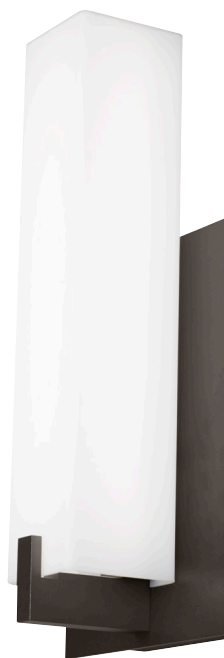
COSMO 18 shown in bronze

* Visit techlighting.com for specific warranty limitations and details.