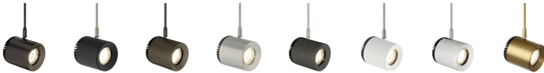
antique bronze / antique bronze black / satin nickel brown chestnut / antique bronze satin nickel / satin nickel weathered gray oak / satin nickel white / satin nickel white ash / satin nickel aged brass / aged brass