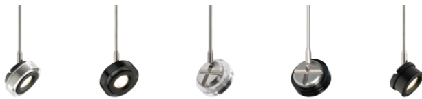
clear black finish transparent smoke black finish clear satin nickel finish transparent smoke satin nickel finish bare