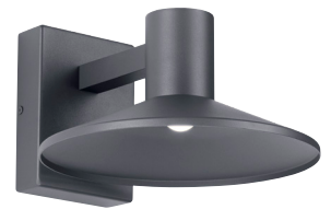
ASH 10 shown in charcoal/clear lens