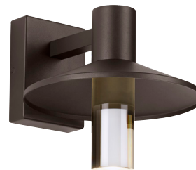
ASH 10 shown in bronze/clear cylinder

* Visit techlighting.com for specific warranty limitations and details.