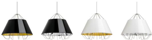
gloss black / gold shade